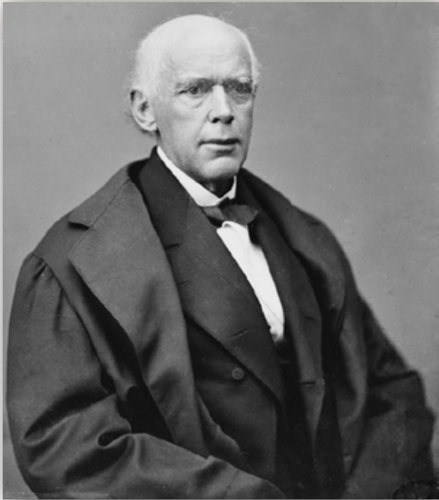
Chief Justice Salmon P. Chase